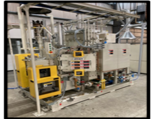
Laser Cutting, Annealing & Press, Heat Treating & Tempering