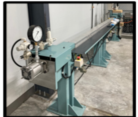
Shot peening & Polishing, Assembly, Measuring, Inspection & QC